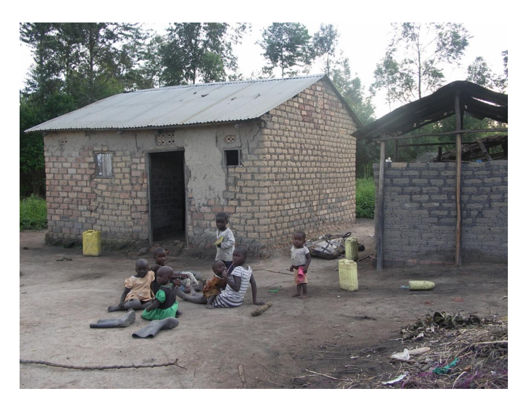
House in need of urgent repair ... windows needed and repair to cracks in the walls

None of this work would be possible without your support but especially without the guidance of God who continues to provide for the needs of our Ugandan friends through the charity's supporters.