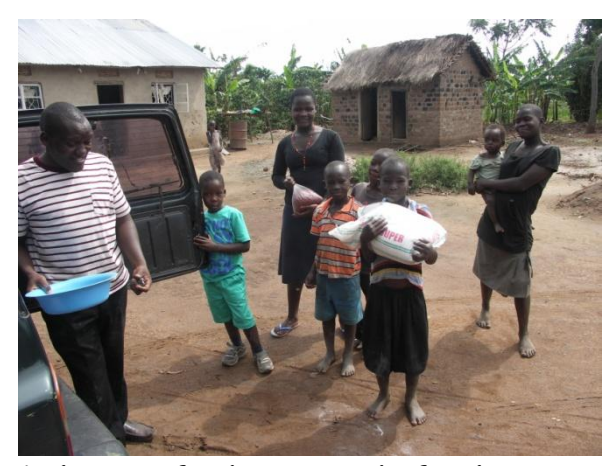
Delivering food to a needy family